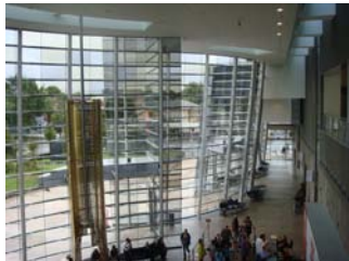
Art Gallery (Civil Defence HQ later)