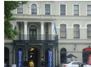
Famous "Beatles" balcony Warners.