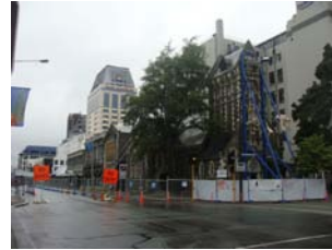
Church damaged, Grand Chancellor OK in Background