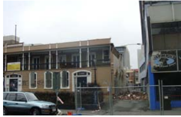
Occidental Hotel – Condemned. Old cricket mate owns that.