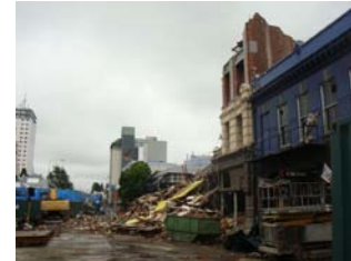
Another Building total loss.