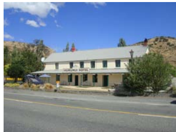
Historic Hurunui Hotel