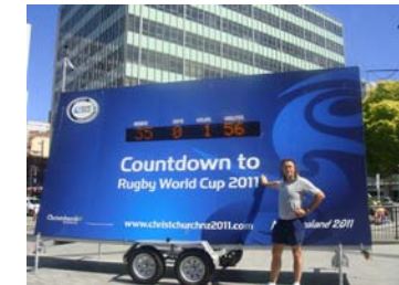
Not quite the countdown expected...