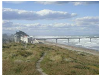
New Brighton Beach Christchurch