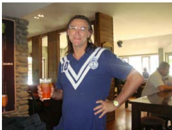
Cold Speights - Hamner