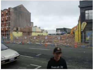
One building GONE...