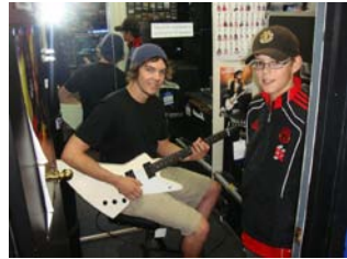
Rockshop only building standing in whole block. Gibson on layby for 21 st .