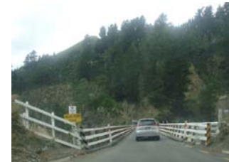
Cass on way to Hamner