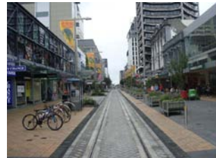
New Tram Lines Cachel Mall for World Cup