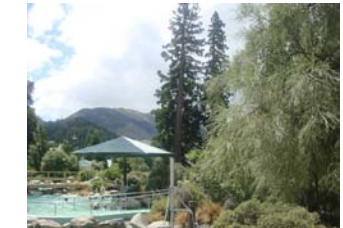
Hamner Springs Thermal Resort