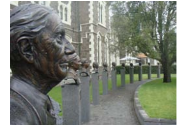
Famous Cantabrians – Arts Centre. (severely damaged later)