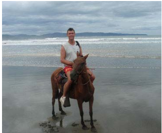
Got to Keep At It