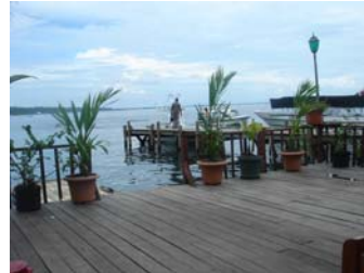
Wet Camera & Lost Wallet Saga