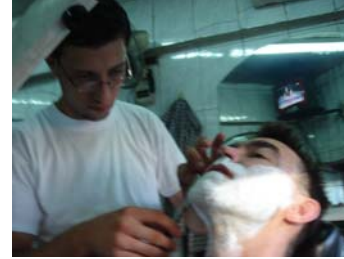
Close Shave Surviving Iraq But Gained $ & Experience