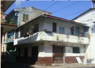
Commercial Property Under Negotiation Still