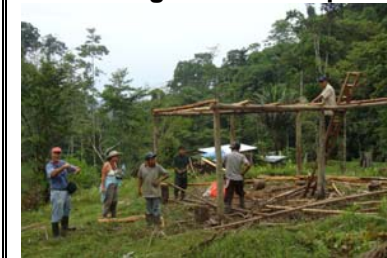
Chiriqui Jan 2010