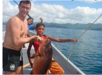
Pargo – A Beauty