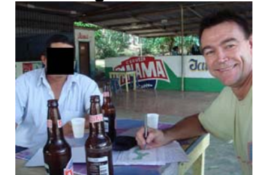
Property Behind Owner – Sante Fe