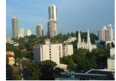
Decided on Panama for "Seachange"