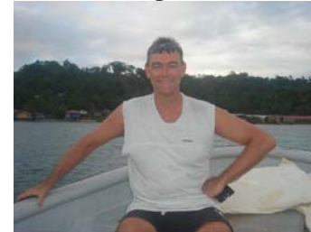
Boat Trip to Calovébora