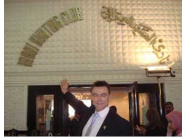
Professional Break in Iraq, Being the Hunted Though