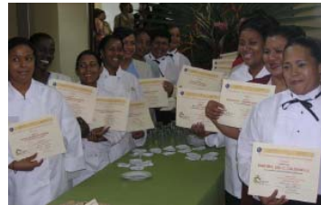
Donation Made Mar 2008 Capacitación Mujeres