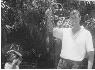
Volunteering & Pro Bono Work in Mexico Towards Expat Paid Job