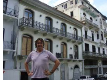
La Merced Unit 1 Casco Viejo